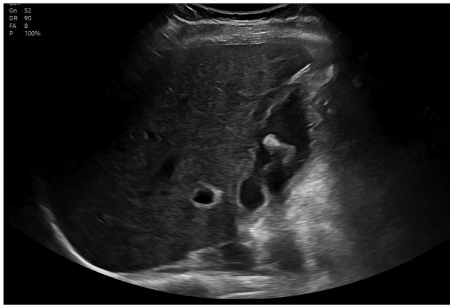
Figure 1: Grayscale ultrasound image of the liver and gallbladder