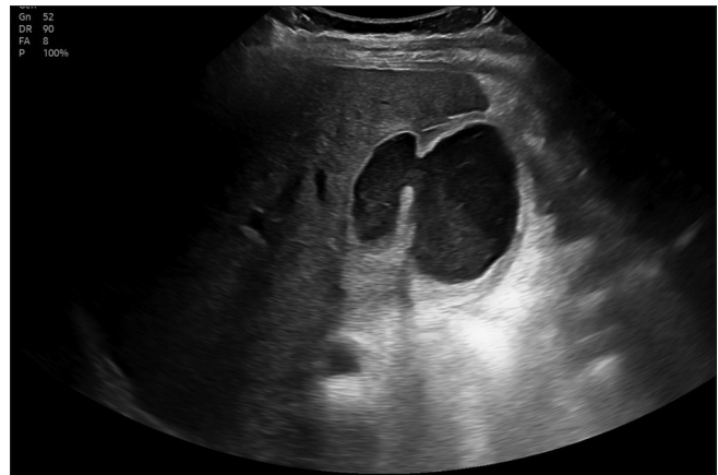
Figure 2: Grayscale ultrasound image of the gallbladder